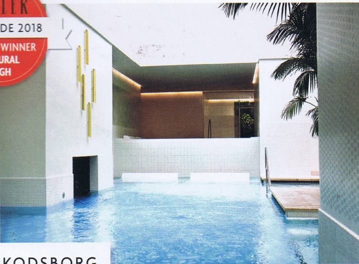
KURHOTEL SKODSBORG SKODSBORG, DENMARK